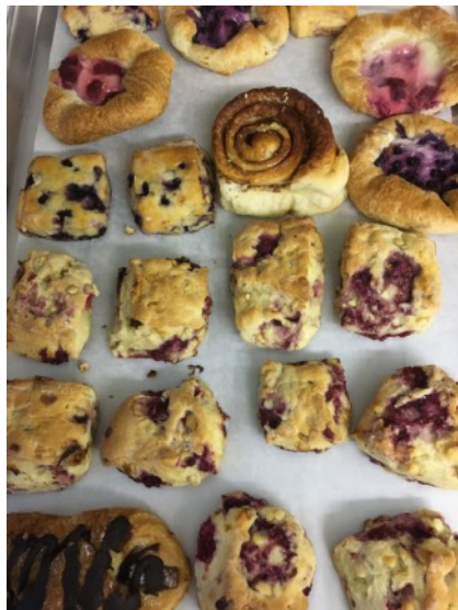
Cobs Bakery continues to be generous.

How busy is Charlene on the day? About 10,000 steps. Probably just as busy the day before.