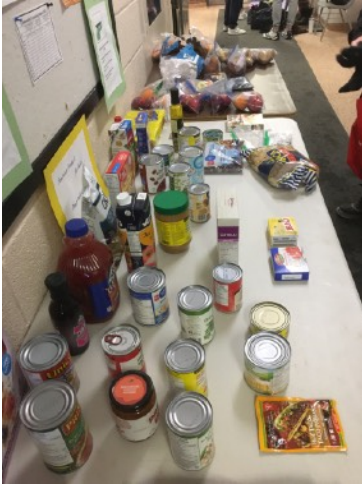
Popular free food table set by Betty and Patti.

Your donated clothing items continue to be appreciated.